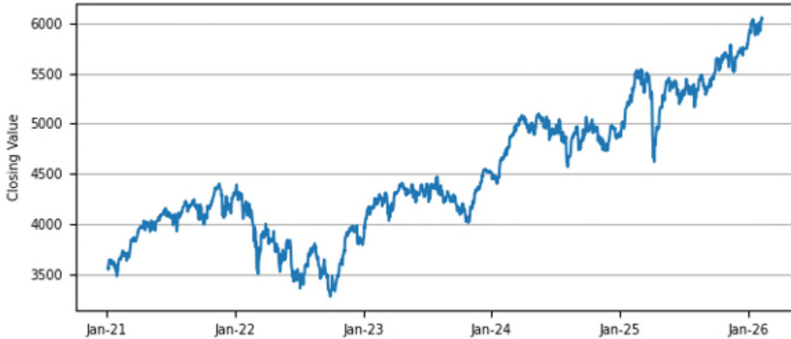
Historical Performance of the SX5E

The historical values of the SX5E should not be taken as an indication of future performance, and no assurance can be given as to the closing value of the SX5E on any coupon observation date, including the final valuation date.